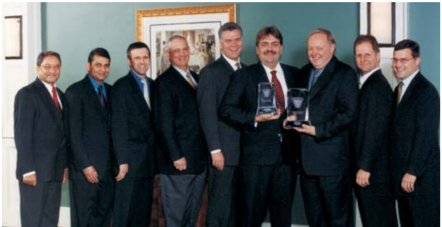
The 2003 SPE Automotive Division "Most Innovative Use of Plastics" Grand Award Winning Team - smart Roadster Roof Module

The roof module developed by ArvinMeritor uses General Electric's new LEXAN SLX film and the Class A surface module replaces painted steel resulting in a 50 percent weight savings. The Lexan SLX film produces a surface weatherable for 10 years, and the team avoided 30 million dollars that would have been required for a new paint line. The lightweight targa top, available in solid or metallic colors, is easily removed and easily repaired. 12,000 Smart Roadsters equipped with the new module have been built in 2003, and in 2004 production is scheduled to reach 120,000.