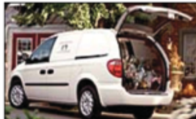
Chrysler Cargo Van Window Alternatives; Thick Sheet Thermoforming