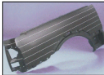
Lincoln Blackwood Box Body Panel; Injection Mold Lamination