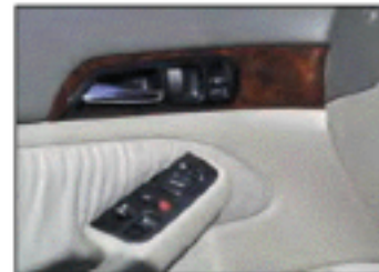
Interior Door Trim Bezel Woodgrain Film.