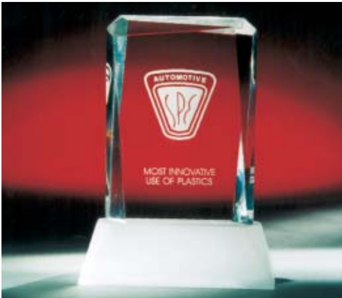
The SPE Automotive Division "Most Innovative Use of Plastics" Grand Award Trophy