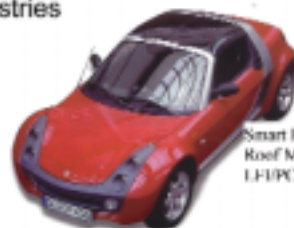
Smart Roadster Roof Module is I-F/PC Film